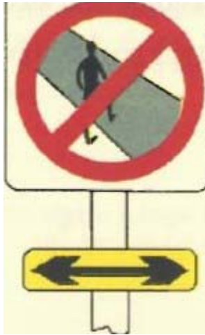
Sign prohibiting crossing of road within 50 metres of either side of a pedestrian crossing