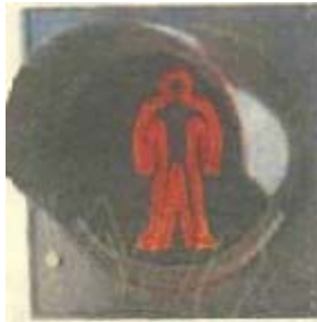
THE RED MAN SIGNAL