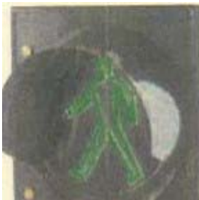
THE GREEN MAN SIGNAL